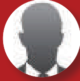
TBC Moderator – 5th Grand Panel